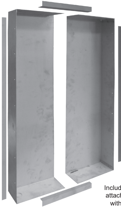
Included steel brackets attach to sides for use with metal framing.